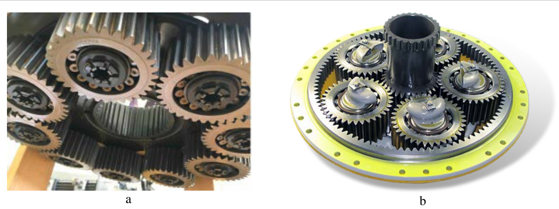
FIG. 1 Planetary gearboxes of the helicopter [6, 7]